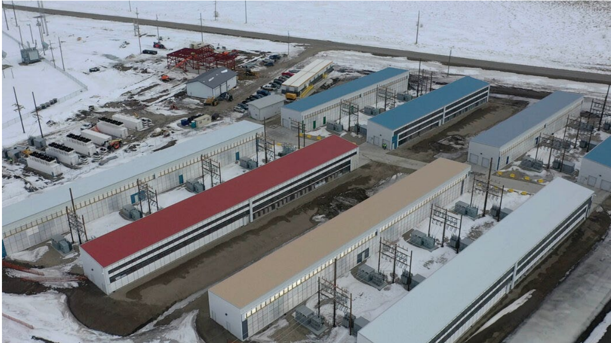
Applied Digital Bitcoin mine in Jamestown, N.D.

Just north of Jamestown, N.D., the land is flat, trees are scarce and, in winter, snow drifts can easily top 10 feet. Even when brisk prairie winds blow, the shrill whine of the fans within Applied Digital's Bitcoin mine can be heard a half-mile away.