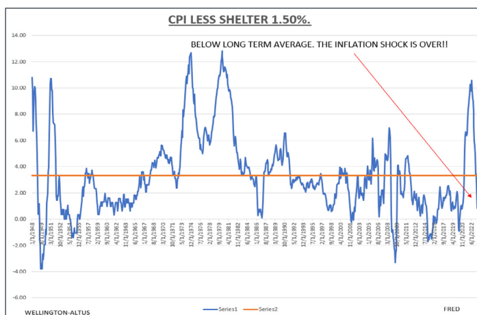
U.S. Core CPI Excluding Shelter

The intensifying forces of digitization, demographics, globalization, and debt have added complexity to the current investment environment. Our short-term base case (2024-25) suggests a return to 2.5 per cent for the Bank of Canada overnight rates by mid-2025. Investors should anticipate a rate cut of 150 bps in 2024 and not discount the possibility of a further reduction in 2025.